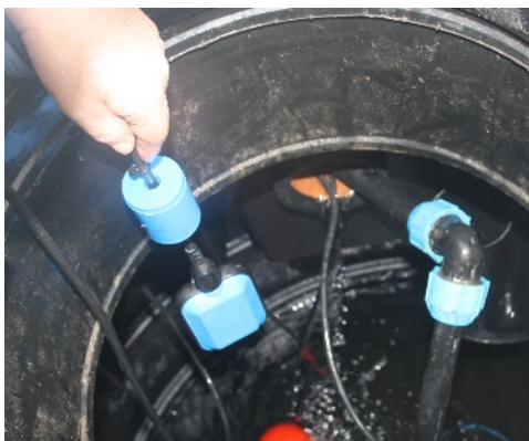
Testing the mains water top up